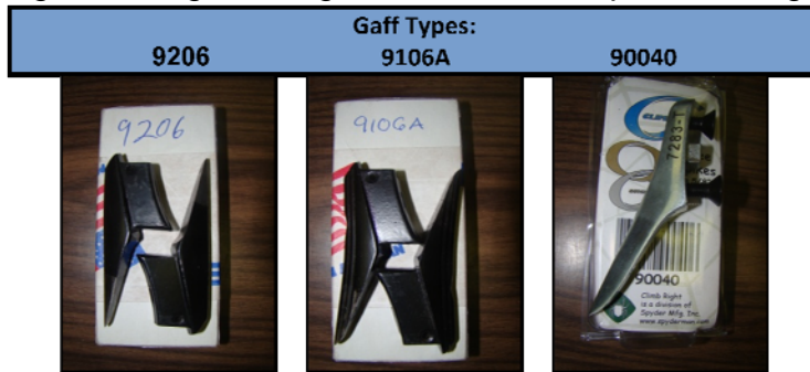
Figure 4. Digital images of the three experimental gaff types.